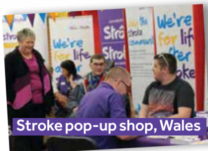
Stroke pop-up shop, Wales

500 mile cycle and climbing 7 mountain peaks over 5 days, Northern Ireland