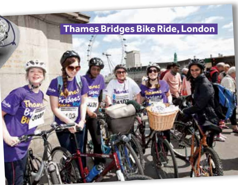
Thames Bridges Bike Ride, London