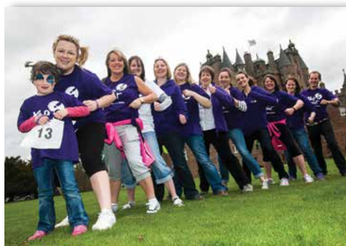
Step out for Stroke at Glamis Castle, Scotland

Here's a selection of photos that capture the spirit of Action on Stroke Month, and the fantastic stroke survivors, supporters, volunteers, fundraisers, family and friends that made it possible.