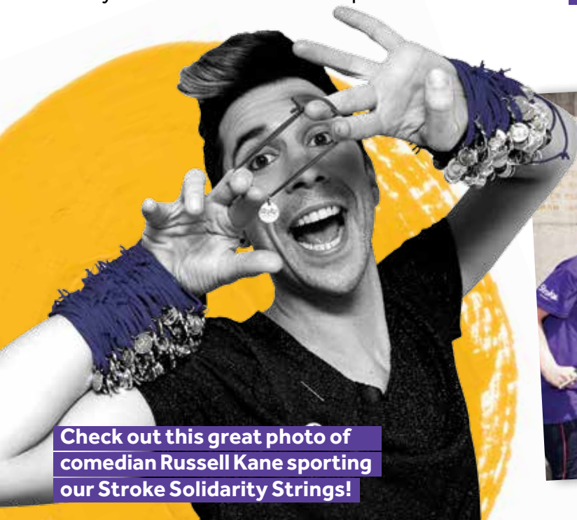
Check out this great photo of comedian Russell Kane sporting our Stroke Solidarity Strings!